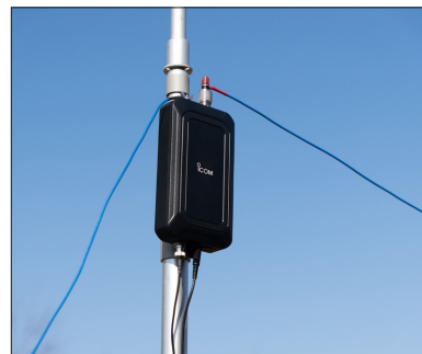
Wire antenna installation example