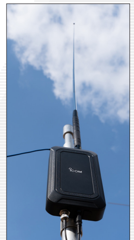
50 Ω antenna example